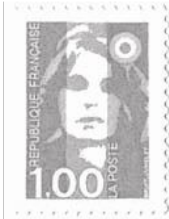
Fig. 2. Catherine Deneuve as Marianne, symbol of France, as commemorated on postage stamp.