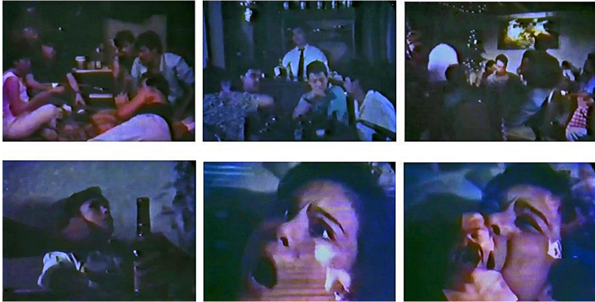
Figure 6. Upper row, left to right: chummy with men, Laura hangs out with her all-male band members including Cholo; later, rejected by her long-time promoter for her dissolute conduct, she drinks alone in a bar where four anonymous men eye her across the room; two of the men proceed to stalk her. Lower row, left to right: she accepts an offer of drinks from the men but one of them slips a pill into her glass; the men take her to a motel, where she realizes their intention to rape her; immobilized by the drug, she is unable to fight back.