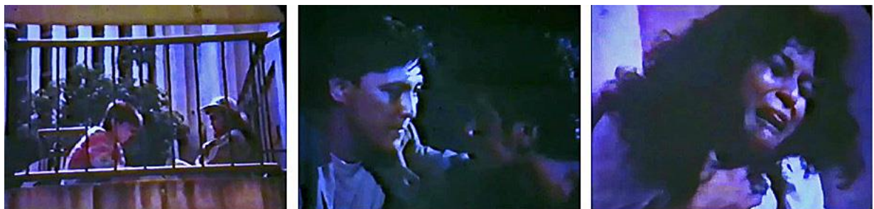
Figure 9. Left to right: Laura, like Nora Aunor in real life, hangs out with even the least among her fans (here a young child, the helpless witness to her downfall and destruction); the men in her narrative behave abusively, but the hierarchy of villainy in GP is determined by class and race, as big-timer Briccio (played by fair-skinned Tirso Cruz III, Aunor’s most durable love-team partner), eliminates his rival Cholo; Aunor also provides Laura with harrowing withdrawal scenes in GP ’s rehabilitation sequences.