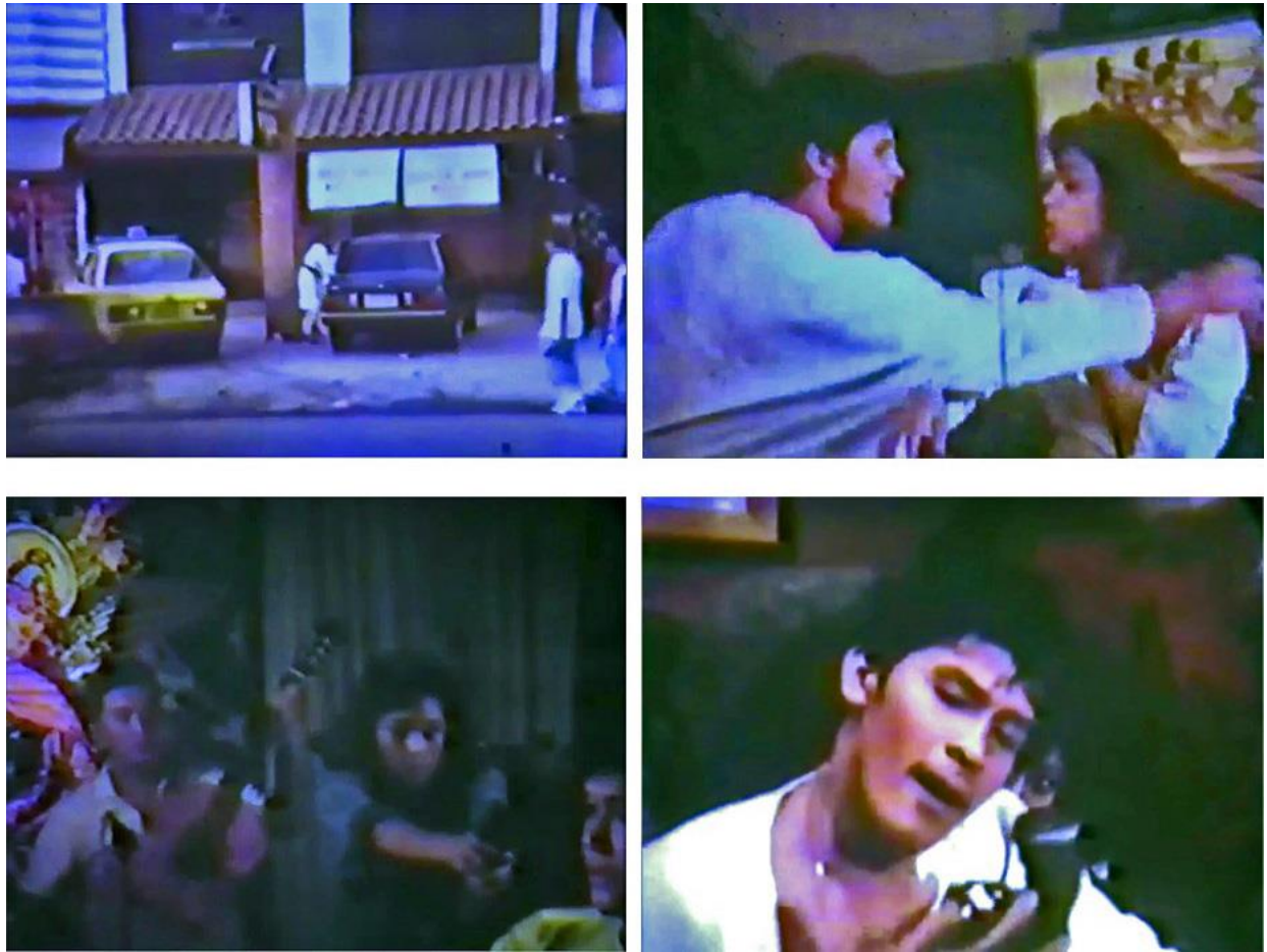
Figure 8. Clockwise from top left: Laura finds her own way home after the rape incident; jealous because of her absence, Cholo turns violent once more and looks for his gun; Cholo plays with his gun as Laura, hiding behind him, tries to determine whether his playful mood is for real; after reconciling with Cholo, Laura sneaks away with his gun to confront her rapists.