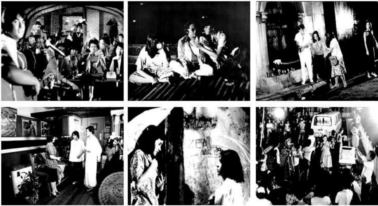
Figure 5. Scenes from Manila by Night, clockwise from top left: gay couturier swoons over folk singer, whom he will eventually successfully seduce; blind masseuse shares pot with her drug-pusher girlfriend and her young girl Friday; masseuse is assisted by gay couturier after praying at a street altar for prostitutes, to seek out a nurse (the common-law wife of the couturier's lover, a taxi driver) who can help her; characters encounter a location shoot outside the hospital where the nurse turns out to be a call girl in disguise; naïve waitress, impregnated by the taxi driver, seeks help from the "nurse," who will be later strangled by an unknown assailant; couturier returns the folk singer to the latter's abusive mother, who also used to be a sex worker.

The ultimate contribution of the milieu movie, if one were allowed to make valorizing claims for it, would begin in the area where classical apologists would perceive a weakness in the format. That is, granting a constant commercial running time of about two hours, a larger number of lead characters would result in less actual characters, since less time could be allotted to the development of each one. On the other hand, what one would be left with, in a project (such as Nashville or Manila by Night ) with sufficient thematic development, is an agglomeration of types. 30 Such an absence of "full" dramatic involvement on the part of the spectator with any individual character, intensified by the constant shifting of identification from one character to another, makes it possible for the viewer to configure instead a social formation—in fact, a social character—within the diegesis of the film text. This then is the point in which the milieu movie takes up a certain road not taken by a crucial progressive movement in the history of cinema: that of social realism. Where the