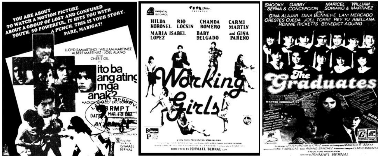
Figure 6. Three of several multi-character movies by Bernal after Manila by Night : Ito Ba ang Ating mga Anak? , on troubled urban youth; Working Girls , on female office workers in the business district; and The Graduates , on young people joining the work force after the period of dictatorship. Newspaper ad layouts posted online by Video 48 weblog, used with permission.

social-realist project was abandoned in classical cinema for some of the same limitations that realism was eventually also critiqued, the milieu movie, in enabling the depiction of interacting social agents, restores a possibility formally unfulfilled by the original social-realist texts.