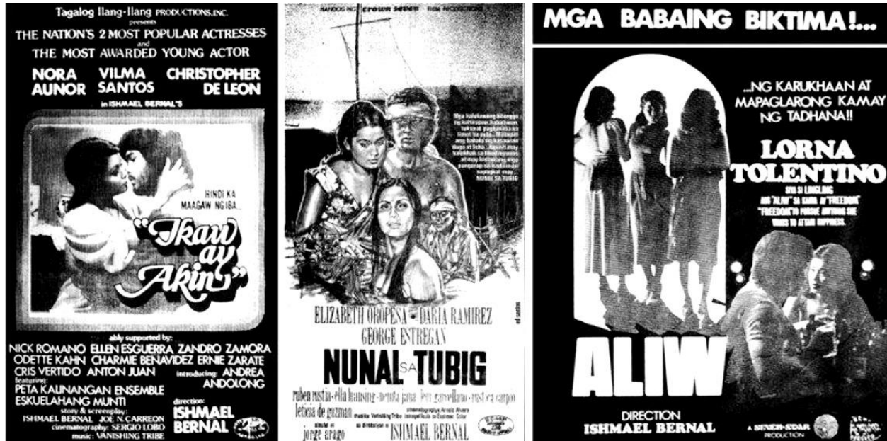
Figure 4. Triple-character films by Ishmael Bernal: male-centered love triangle in Ikaw ay Akin ; women-focused triangle in Nunal sa Tubig ; equal-emphasis triumvirate of female sex workers in Aliw . Newspaper ad layouts posted online by Video 48 weblog, used with permission.

narratives, notably the star vehicles Dalawang Pugad , Isang Ibon (Two Nests, One Bird, 1977) and Ikaw Ay Akin (You Are Mine, 1978). After dispensing with erotic relations among the three main characters in Aliw , he proceeded with a far more commercial (and consequently critically overlooked) exercise, Menor de Edad (Underage, 1979), with a slightly larger number of characters (five instead of three) but maintaining the emphasis on women-only leads. The commercial success of the last two films enabled the Nunal sa Tubig producer, Jesse Ejercito, to re-establish his renamed production outfit, and emboldened Bernal to devise a large, diverse, sprawling, contentiously interacting cast of characters, the closest so far to the sample that Nashville embodied.