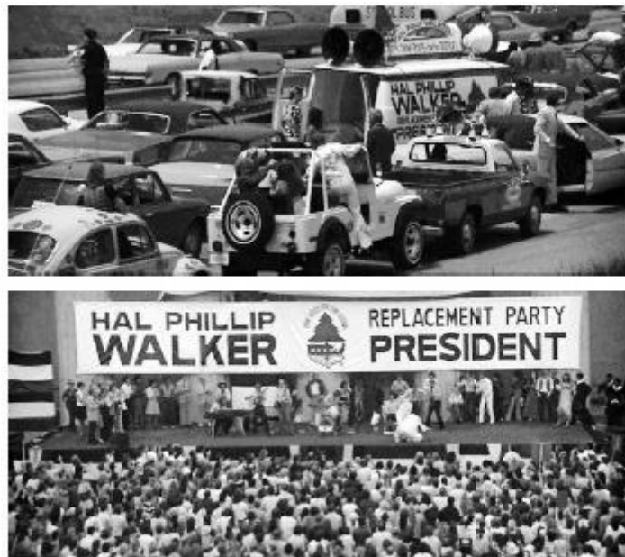
Figure 1. Disaster film, progressive text, or both? Car pile-up and outdoor concert assassination in Nashville . MGM DVD, screen captures by author.

Two short studies that can be related to the present one deal with multiple characters, but only implicitly. In opening his essay “The Compound Genre Film,” Adam Knee echoes this literature survey’s lament by stating that “Although it is commonplace to note the proliferation of varied genre combinations in commercial films of the eighties, the notion of what, precisely, constitutes and characterizes a compound genre film has been very little discussed” (141). He differentiates this type of work from two other related types of mixed-genre products: the genre hybrid, an organically derived entity in which two or more sets of generic conventions have somehow become one; and the subgenre, the seemingly natural development within one genre of certain characteristics which happen to be shared by another genre (141). The compound genre itself is defined by Knee as a type of film “that concurrently engages multiple distinct and