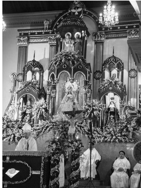
Figure 2. Retablo at Obando Church, taken during the district's 2008 fiesta.