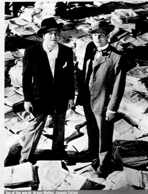
Top of the world: Orson Welles, Joseph Cotten

Citizen Kane (1941): dir Orson Welles; scr Herman J. Mankiewicz, Orson Welles; director of photography Gregg Toland; editor Robert Wise; art directors Van Nest Polglase, Perry Ferguson; music Bernard Herrmann