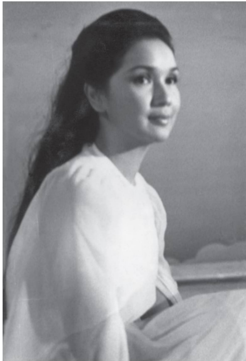
Susan Roces glamour photo.