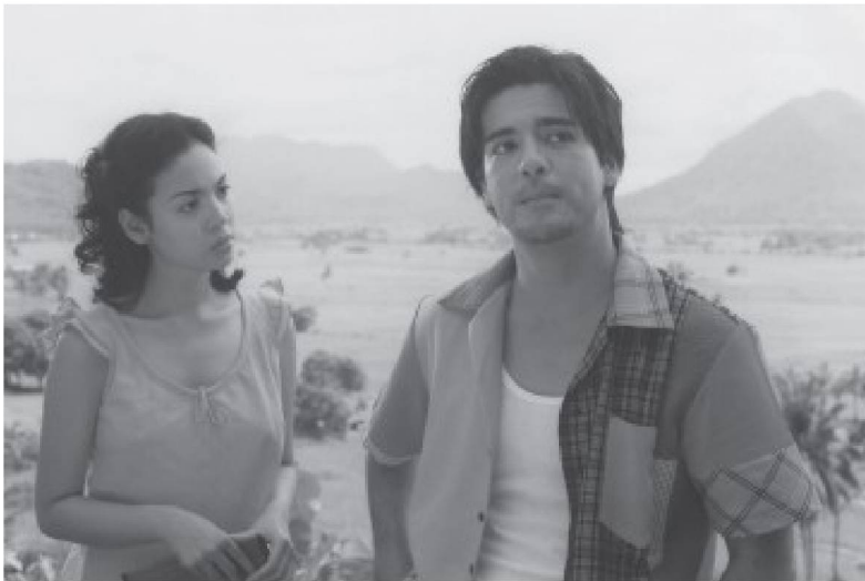
Aga Muhlach and Claudine Barretto in Kailangan Kita .

This essay focuses only on the gender roles of the protagonists and their relationship with one another, although all three films are multifaceted and polysemic, rich in texture and in issues confronting contemporary Philippine society. Both Claudine Barretto and Judy Ann Santos, the leading young female stars of this generation, are also known