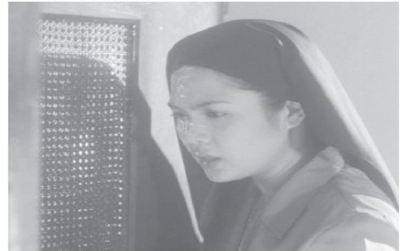
Judy Ann Santos in Sabel .