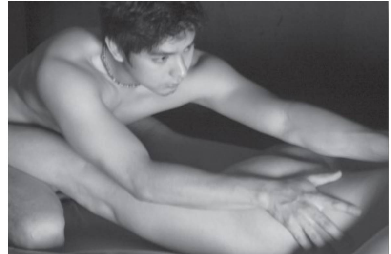
Coco Martin in Masahista . Produced by Centerstage Productions.