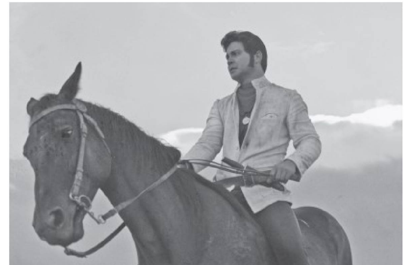
FPJ: The Mythic Icon.

Of course, he had limitations too in this regard, just as Avellana, De Leon, Brocka, Bernal, and Romero did during their respective periods. While for the others these limitations comprised the commercial imperatives of an art industry, in the case of FPJ his limitations were self-imposed, in accordance with his personal vision as a filmmaker profoundly in touch with an audience to whom and for whom he had always endeavored to make his work accessible. He was unmindful of what supposedly more discriminating critics—staunch advocates of a particular aesthetic sense and set of artistic standards not always compatible with his own—might have thought and said.