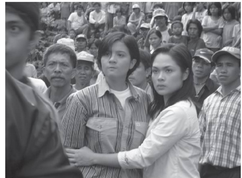
Judy Ann Santos and Sunshine Dizon in Sabel .