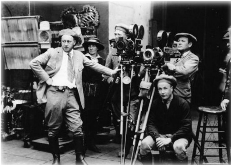
Fig. 1. Printing as an extension of literary production, vs. film production as the essential component of filmmaking.