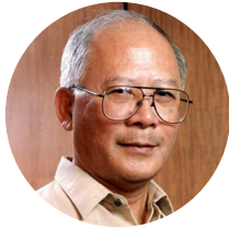
Bienvenido Lumbera University of the Philippines