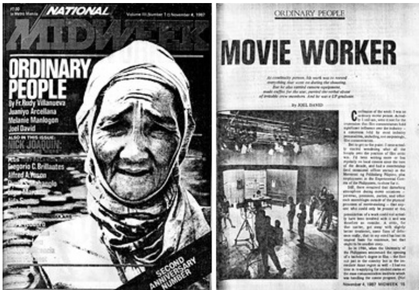
Fig. 2. Special Labor Day 1987 issue of National Midweek (defunct); from the author's collection.

I will admit that I wished that when I first stated my newly formulated ethical premise, my colleagues hailed me as harbinger of a useful and progressive insight. In reality, I collected a number of verbally abusive responses then, and still do so occasionally today. Strangest of all, for me, is the fact that these almost entirely come from representatives of the national university, bastion of claims to Marxist ideals in the country. My aforementioned premise runs as follows. Because of its industrial nature, film practice enables individuals to support themselves and their families and acquaintances. We kid ourselves if we merely focus on the high-profile examples of celebrities and producers and major creative artists: the majority of people working on any sufficiently busy project would actually be working-class, as I had been when I worked in the industry.