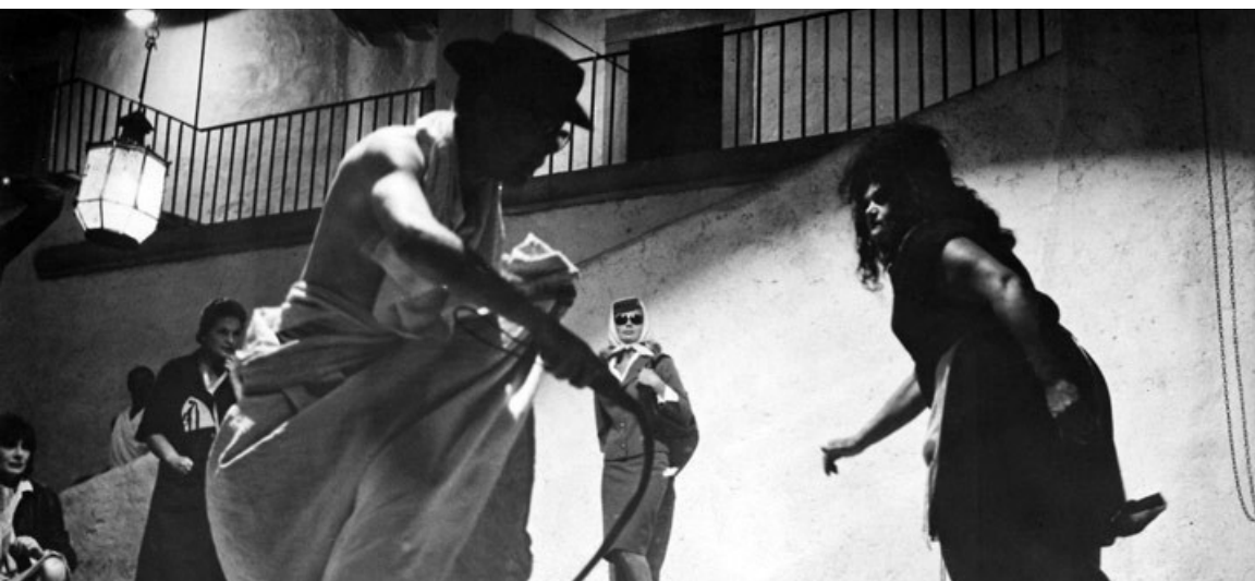
Fig. 3. Federico Fellini's 8½ (1963), which appears in both the US Legion of Decency's list of condemned films as well as the Vatican Film List comprising titles endorsed to the Catholic faithful.

mark contemporary evaluations of film and cultural artefacts, and will probably be surprised when today's so-called trash items become tomorrow's objets d'art .