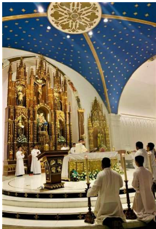
Figure 4. The retablo behind the altar and Mass assemblage, at the Chapel of the Holy Guardian Angel at the Holy Angel University in Angeles City, Pampanga Province.

local audiences to look front and upward while seated in rows in regular attendance, one need only replace altars with screens in order to complete the analogy. The element of multiplicity comes in when we consider the spectacle available in the major traditional churches: the retablos (see Figure 4), or altar pieces, reminiscent of Mexico, where “the foci were the niches containing the santos [icons of the saints]” (Javellana 156).